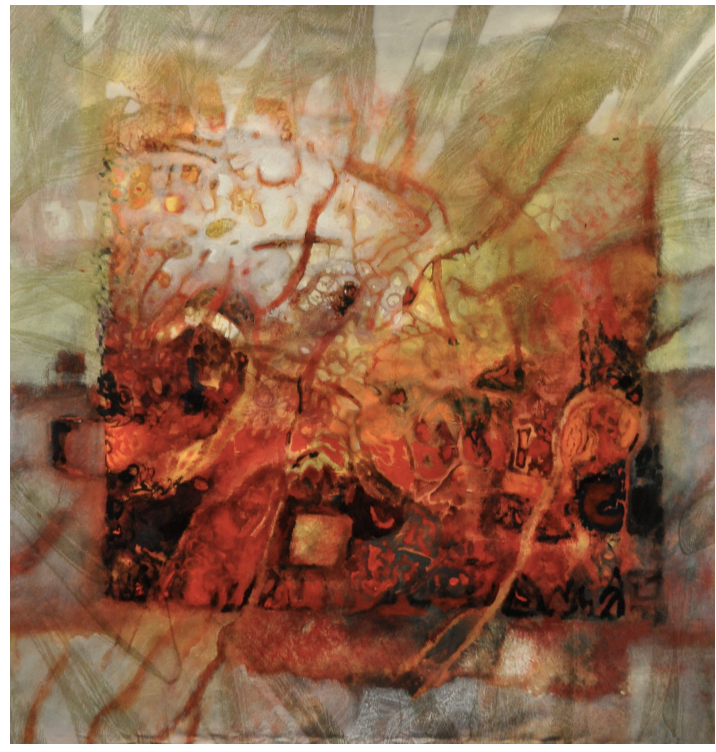
Bonfire (Hoguera) 2010, acrylic on canvas, 46" x 36"

Very little that is manufactured in the contemporary world (and that includes much of today's art) is handmade by a single artisan toiling alone in the studio. Mills creates physical, handmade, "analogue" objects for a society enthralled by the "digital" spectacle of daily life. Such an act is dissident, but it is also a revelation...and an